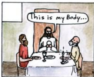
Figure out the order of the pictures and put the appropriate numbers in the corners.

How well do you know the story of the two disciples on the road to Emmaus?