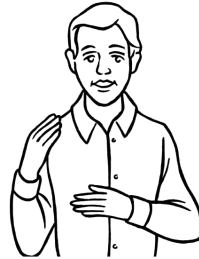
4. Touch your right shoulder and pray, "Spirit, Amen."

How to make the Sign of The Cross - © TheCatholicKid.com