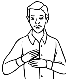
2. Touch the center of your chest and pray, "and of The Son."