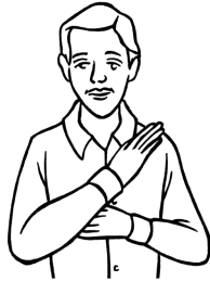
3. Touch your left shoulder and pray, "and of The Holy..."