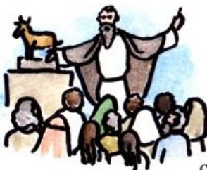
Joshua 24:1-2, 15-18

In today's first reading, Joshua told the people that they had to choose between the false gods and the true God. Joshua and the people chose to worship the true God.