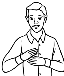
2. Touch the center of your chest and pray, "and of The Son."