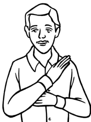
3. Touch your left shoulder and pray, "and of The Holy..."