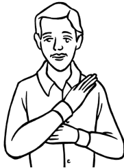
3. Touch your left shoulder and pray, "and of The Holy..."