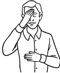
1. With your right hand, touch your forehead and pray, "In the name of The Father."