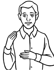
4. Touch your right shoulder and pray, "Spirit, Amen."

How to make the Sign of The Cross