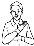
3. Touch your left shoulder and pray, "and of The Holy..."