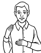
4. Touch your right shoulder and pray, "Spirit, Amen."

How to make the Sign of The Cross