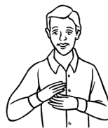
2. Touch the center of your chest and pray, "and of The Son."